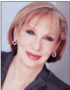
Dr. Joy Browne 7 to 10 pm