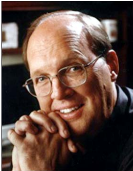
Neal Boortz 9 am to Noon