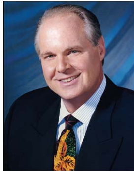
Rush Limbaugh Noon to 3 pm